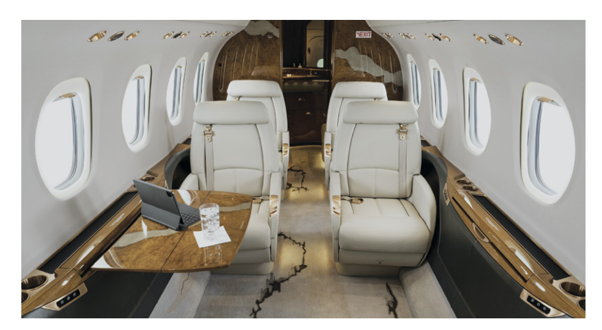
CESSNA CITATION LATITUDE